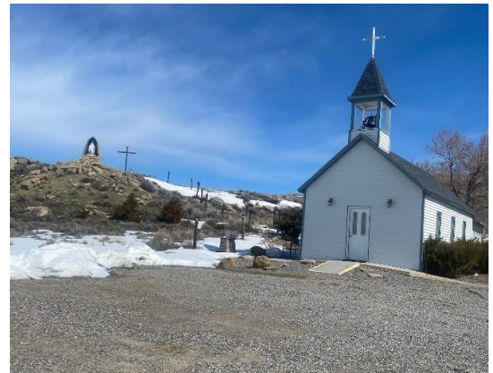
St. Edward Mission Church, Kinnear, WY (Population 44)

Life for Catholics in Wyoming looks very different from life in urban dioceses.