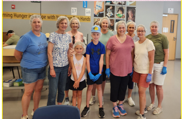
St. Paul packing session during the summer.