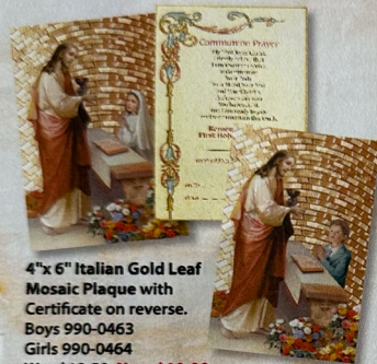
4"x 6" Italian Gold Leaf Mosaic Plaque with Certificate on reverse. Boys 990-0463 Girls 990-0464 Was $12.50 Now $10.00

Valid In Store and Online. Must have Item code 990. Expires 4/30/2024