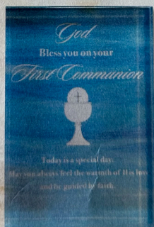
Etched Glass First Communion Remembrance Plaque 990-0020 Was $13.99 Now $11.39