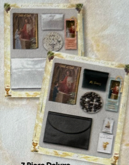
7 Piece Deluxe Communion Gift Set Includes: Deluxe Missal, Deluxe Rosary, Deluxe Rosary Case, Bookmark, Satin Purse (girls), Scapular and Pin. Girl 990-0507 Boy 990-0005 Was $48.99 Now $39.19