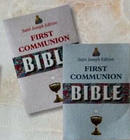
First Communion Bible St. Joseph New Catholic Bible Edition. Includes First Communion certificate. Girl-Pink 990-0395 Boy-Blue 990-0396 Was $28.00 Now $22.40