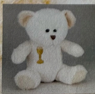
7" White Plush Stuffed Communion Teddy Bear with Gold Embroidered Chalice. 990-0243 Was $13.99 Now $11.19