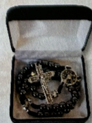
6mm Hematite Cord Communion Rosary with box 990-1054 Was $34.99 Now $27.99

1600 W. PARK AVE. · LIBERTYVILLE, IL 60048 · 847-367-7800 EXT. 236