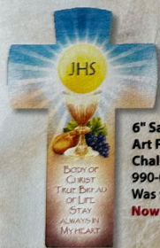
6" Satin Finished Fine Art First Communion Chalice/Cross 990-0665 Was $24.95 Now $19.96