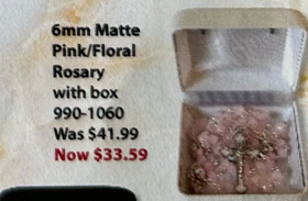
6mm Matte Pink/Floral Rosary with box 990-1060 Was $41.99 Now $33.59