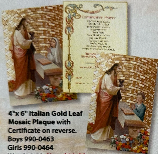
4"x 6" Italian Gold Leaf Mosaic Plaque with Certificate on reverse. Boys 990-0463 Girls 990-0464 Was $12.50 Now $10.00

Valid In Store and Online. Must have Item code 990. Expires 4/30/2024