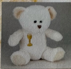
7" White Plush Stuffed Communion Teddy Bear with Gold Embroidered Chalice. 990-0243 Was $13.99 Now $11.19