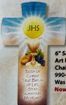
6" Satin Finished Fine Art First Communion Chalice/Cross 990-0665 Was $24.95 Now $19.96