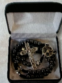
6mm Hematite Cord Communion Rosary with box 990-1054 Was $34.99 Now $27.99