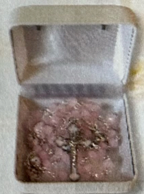
6mm Matte Pink/Floral Rosary with box 990-1060 Was $41.99 Now $33.59