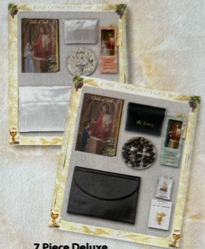
7 Piece Deluxe Communion Gift Set Includes: Deluxe Missal, Deluxe Rosary, Deluxe Rosary Case, Bookmark, Satin Purse (girls), Scapular and Pin. Girl 990-0507 Boy 990-0005 Was $48.99 Now $39.19