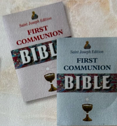
First Communion Bible St. Joseph New Catholic Bible Edition. Includes First Communion certificate. Girl-Pink 990-0395 Boy-Blue 990-0396 Was $28.00 Now $22.40