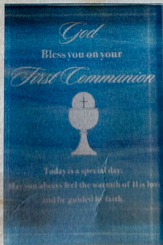
Etched Glass First Communion Remembrance Plaque 990-0020 Was $13.99 Now $11.39