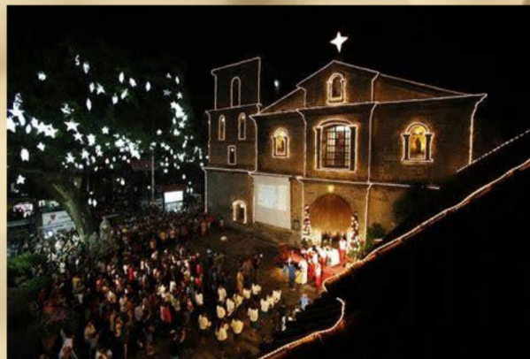
Filipino-American families attending Simbang Gabi in winter